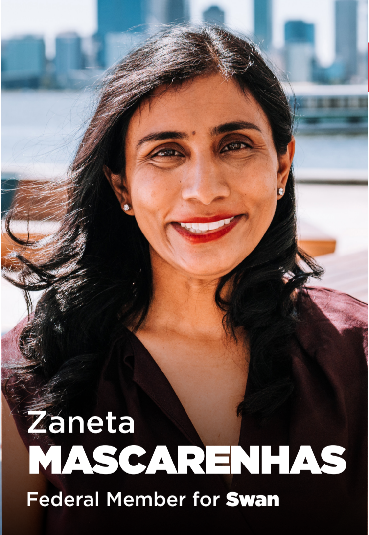
Zaneta MASCARENHAS Federal Member for Swan