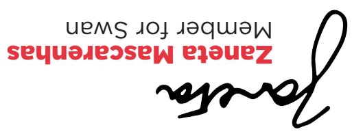
Zaneta Mascarenhas Member for Swan

I live locally, love this community and am deeply committed to it. I grew up in a hardworking family - Dad was a metalworker, Mum a kindy cleaner, and my first job was on the checkout at Woolies. After school, I moved to Perth to study science and engineering at Curtin University. Over 15 years as an engineer , I worked on the mines , often as one of the few women on site. As your Federal MP, my goal is to build a fairer, stronger, greener, and kinder Australia and make a real difference in our diverse Swan community. I believe in listening to locals, championing your voices, and delivering real outcomes. Whether it's better healthcare, improved infrastructure, or better wages for essential workers, I'm committed to working alongside you for lasting change.